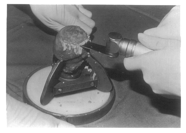
Fig. 1. Resection of the apex of the femoral head.