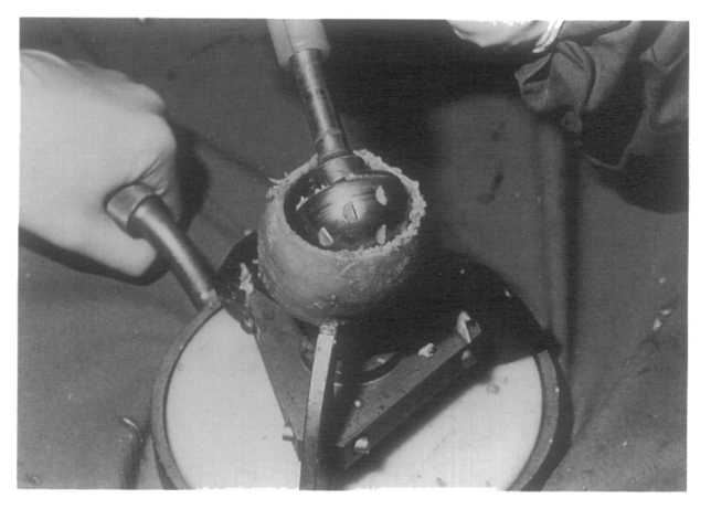
Fig. 3. Reaming of the femoral head.